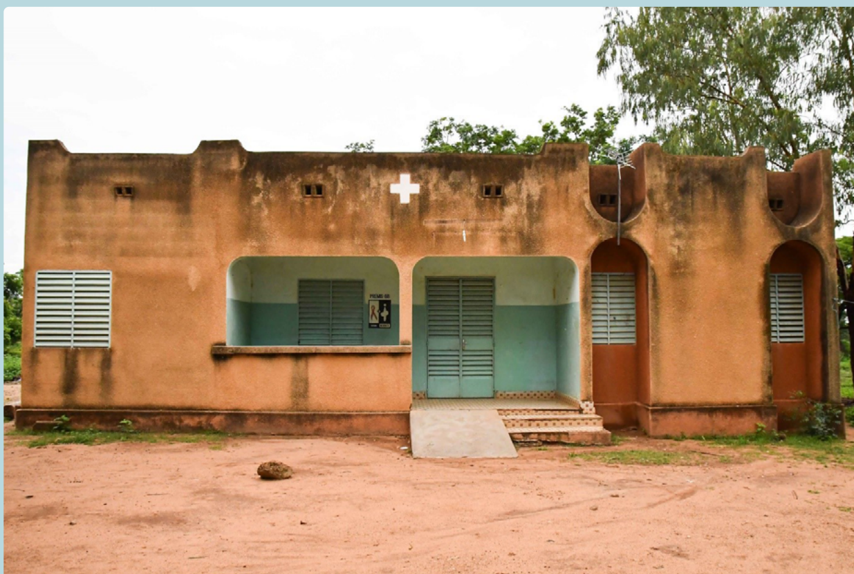
Health centre of sector 8, Banfora, Burkina Faso

In the pursuit of our purpose, IRC understands the importance not just of systems but of the connectedness of the different systems that surround and interact with water, sanitation and hygiene. In much of our work over the last decade, we have focussed on defining WASH service delivery from a systems perspective. It is now time to reach out of our WASH silo and actively engage with other systems: health; education; economic development; and climate - engaging them in our advocacy and learning - supporting them in theirs. The aim is to build allyship and mobilise broader coalitions nationally, regionally and globally. This is the rationale for the connect agenda that lies behind our Connect programme and All Systems Connect 2023.