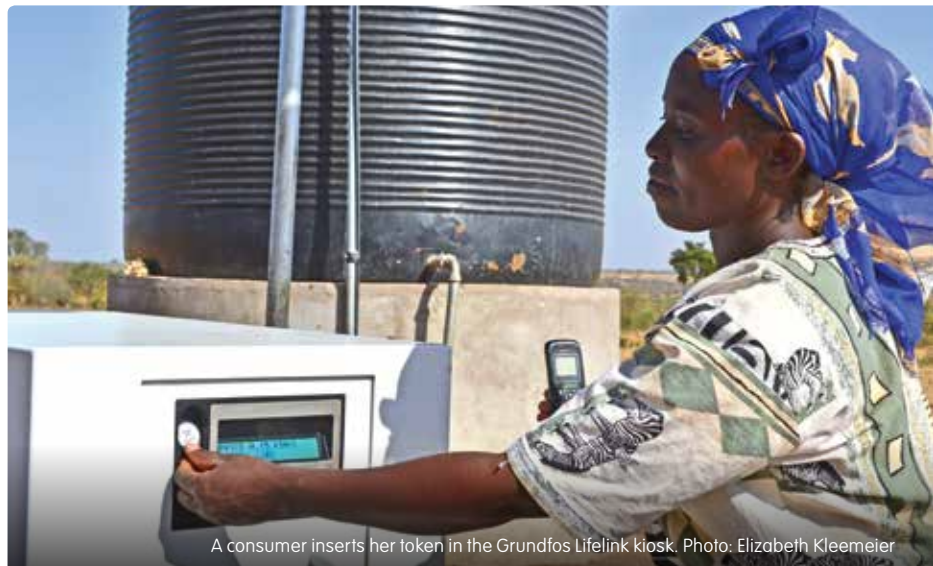
A consumer inserts her token in the Grundfos Lifelink kiosk.

Community management, the dominant model for rural domestic water service, works in many contexts but faces several critical challenges, particularly in regard to more complex water supplies. An alternative is to delegate operations and maintenance, or maintenance only, to the private sector through formal contracts and performance agreements. These public-private partnerships (PPPs) potentially harness market incentives to improve service delivery and leverage private capital for investment costs.