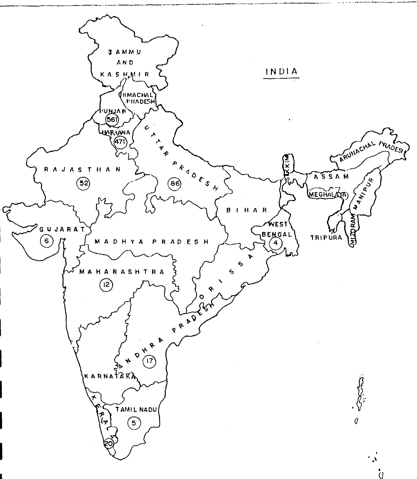
FIG. 1. SLOW SAND FILTER INSTALLATIONS IN INDIA