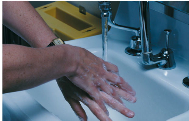
Figure 1. Handwashing, a barrier to transmission of enteric pathogens.

Diarrhoeal diseases are amongst the top three killers of children in the world today. 1 At least 20 viral, bacterial, and protozoan enteric pathogens, including Salmonella spp , Shigella spp , Vibrio cholerae , and rotavirus, multiply in the human gut, exit in excreta, and transit through the environment, causing diarrhoea in new hosts. Because diarrhoeal diseases are of faecal origin, interventions that prevent faecal material entering the domestic environment of the susceptible child are likely to be of greatest significance for public health. 2 The key primary barriers to the transmission of enteric pathogens are safe stool disposal and adequate handwashing (figure 1), especially after contact with faecal material during anal cleansing of adults and children. 3 Hands serve as vectors, transmitting pathogens to foodstuffs and drinks and to the mouths of susceptible hosts. In a 1997 review Huttly quoted five studies on handwashing with a median reduction in diarrhoea incidence of 35%. 4