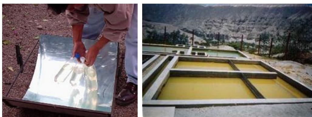
Figure 2. Arsenic removal using the SORAS process.

In this context, the combination of solar oxidation with one of the conventional adsorption processes might be a pertinent development towards yet another promissory alternative to arsenic