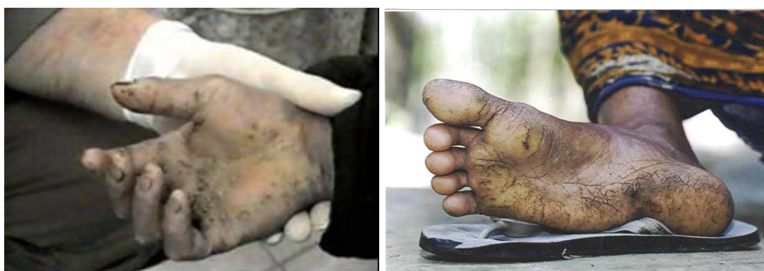
Figure 1. Skin lesions caused by prolonged ingestion of arsenic.

The conclusions of several epidemiological studies confirmed the potentially carcinogenic effect (skin, lung, bladder, kidney, liver, uterus and gallbladder) of a few inorganic species of arsenic when present in high concentrations. This led the WHO to recommend in 1993 a more restrictive guidance value of 10 ppb as the quality standard for drinking water, a value that is five times lower than the previous recommended limit. This drastic reduction in the maximum arsenic limit issued by the WHO has an essentially preventive character, since that parametric value is not yet sufficiently supported by extensive and conclusive epidemiological studies that are urgently warranted. Later on, in 2003, the United States Environmental Protection Agency (USEPA) drafted a proposal issuing final guidelines for cancer risk assessment [11]. The revised document advocates the use of nonlinear relationship between arsenic carcinogenesis and its dose in drinking water.