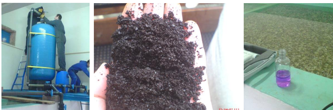
Figure 5. Installation of the reactive filter using iron oxide adsorbent medium.

The combination of filtered and unfiltered flows ( 25 \text{ m}^3 \times \text{h}^{-1} ) allowed for a final water arsenic concentration below 8 ppb, as depicted in Figure 6.