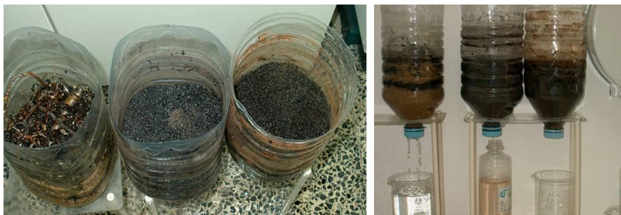
Figure 4. Laboratory experimental trials for the selection of the most effective and viable methods.

A second set of laboratory trials was conducted using a raw water sample with an initial concentration of 18 ppb. Removal efficiencies between 77 and 88% were attained through a