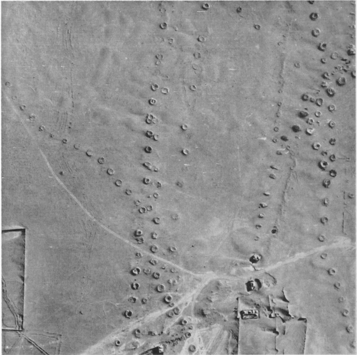
FIG. 3. Detailed aerial photograph (1:3,000) of qanats at the southern margin of the city of Kirman, Iran. Note their passage through abandoned fields in the lower center.

engineering task in the entire operation. 6 The qanat is aligned so that a gently sloping tunnel from the water-filled base of the mother well will flow surface above the irrigated fields of the settlement. If the tunnel emerges far from the settlement, water will flow on the surface in an open channel to the houses and fields. In such cases, evapora-