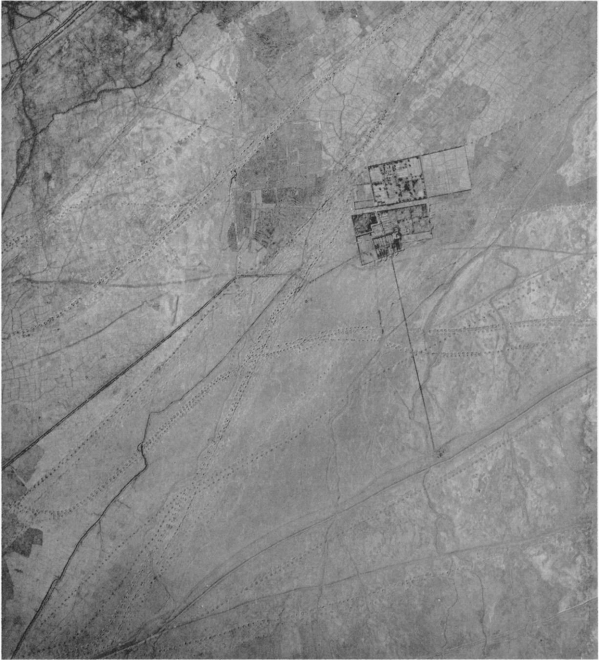
FIG. 2. Aerial photograph (1:18,750) illustrating the "chain-of-wells" effect of qanats located south of the city of Kirman, Iran. Note qanat entering gardens in upper right.

point for the construction of a qanat . This shaft will be called the mother well ( madari chah ) of the qanat , though the term is misleading because water is not removed from the ground at this point. The length of the qanat is measured from the mother