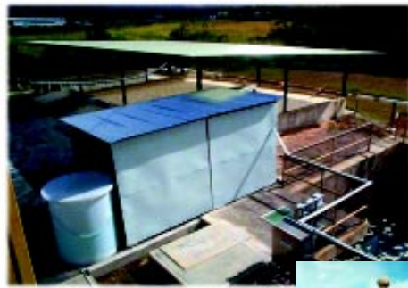
Water disinfection station at Coto Laurel