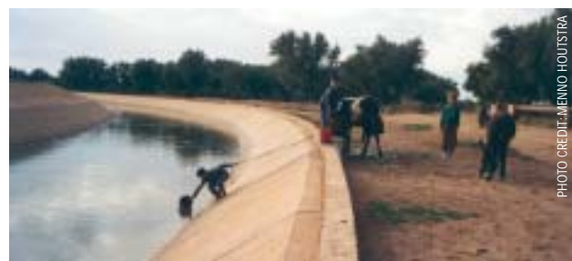
Children collecting water for drinking and other household uses from an canal in Morocco. The task of collecting water often falls on children, in many cases preventing them from attending school. It can also be dangerous work—every year several children drown in the canals.

When communities design their own water systems, they invariably plan for multiple uses. And, when single-use, public supply schemes are provided, they are almost