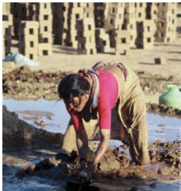
Woman making bricks, India. People use domestic water supplies and irrigation water for a range of such small-scale enterprises. These uses may be considered “illegal” by water managers and can strain the capacity of domestic systems.

Catalyzing Change: A Handbook for Developing Integrated Water Resources Management (IWRM) and Water Efficiency Strategies provides practical advice on how to tackle these issues.