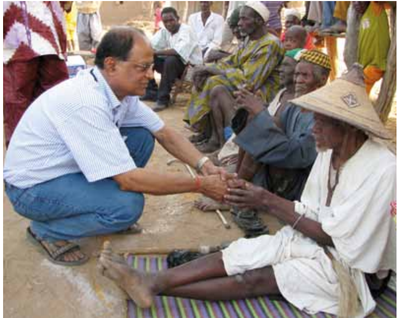
Being respectful to local community leadership is essential. Chief in a village in Mali is greeted before starting the CLTS triggering session.

cameraman and spend a bit more time in groups that are a bit weaker. Use a vehicle to travel quickly to the groups.