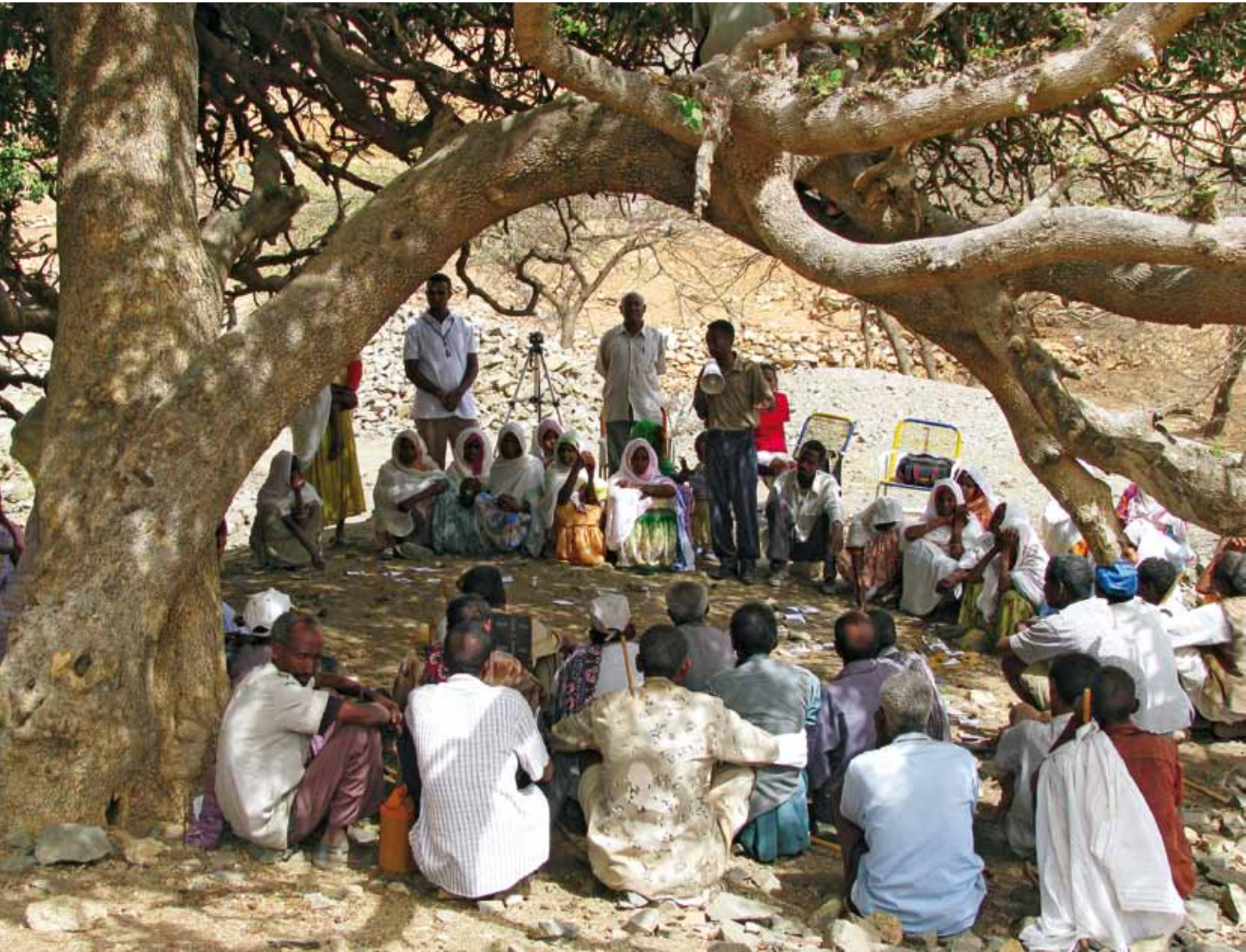
Video cameraman has been requested to move out of the map and shoot quietly without disturbing the proceedings of triggering.