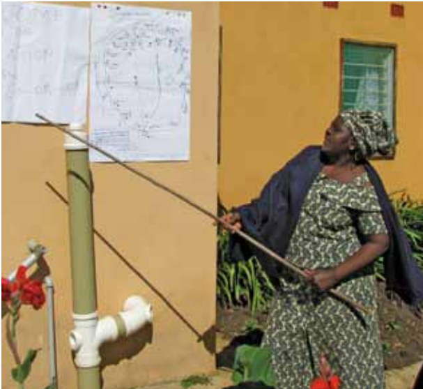
Woman from a triggered community making presentation, Chisamba, Zambia.

Display on a flip chart or some other means the objectives of the workshop. Read them out and ask if participants understand them well. Ask if any clarifications are needed. Relate the objectives to the expectations.