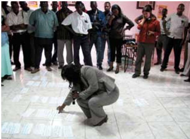
Participating trainers sorting out expectation cards under different topics – Mozambique.

Facilitate a participatory session to set norms for behaviour and interaction, such as arriving on time, and not leaving early, switching off mobile phones, not interrupting others, and keeping to agreed time spans for group work. One option is to appoint timekeepers, who can then use whistling, clapping or other noises to signal starting and finishing times and ensure that everyone follows the schedule.