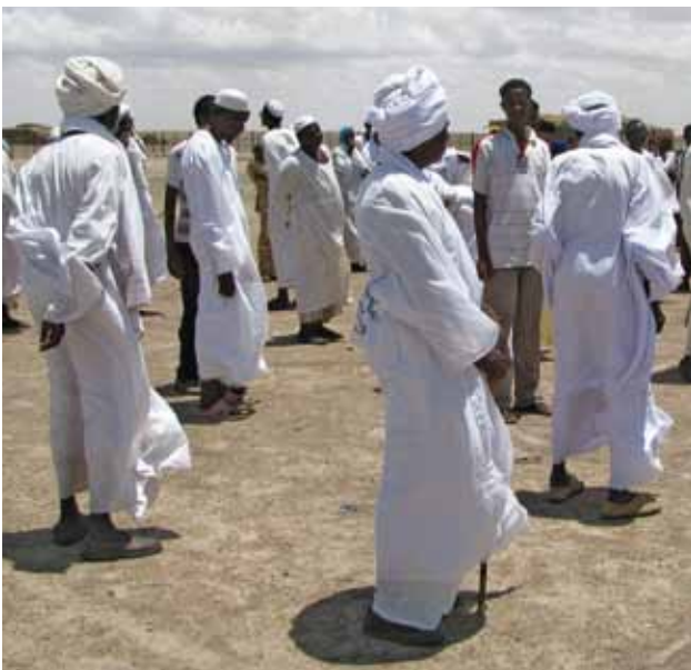
Right: Lack of space between presenter groups and scorching sun adversely affect the quality of the presentation.

The video camera-person has several key roles: 1) recording participants on video to play back to them and show their behaviour and attitudes, 2) recording on video what is done by the community in immediate follow up after triggering to play back to them and the whole group on the last day and 3) recording community members on video when they present on the last day and declare target dates for becoming ODF, and the reactions and responses of senior policy makers and others.