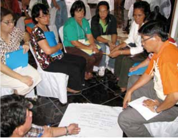
Participating trainers at group work in the breakout session- Eastern Samar, Philippines.

This is not suggested as a rigid frame but as a sequence and timing that has been found practical. The first day is quite intense. Participants sometimes say that they are not ready to trigger on day 2, but there is much to be said for learning by doing without delay.