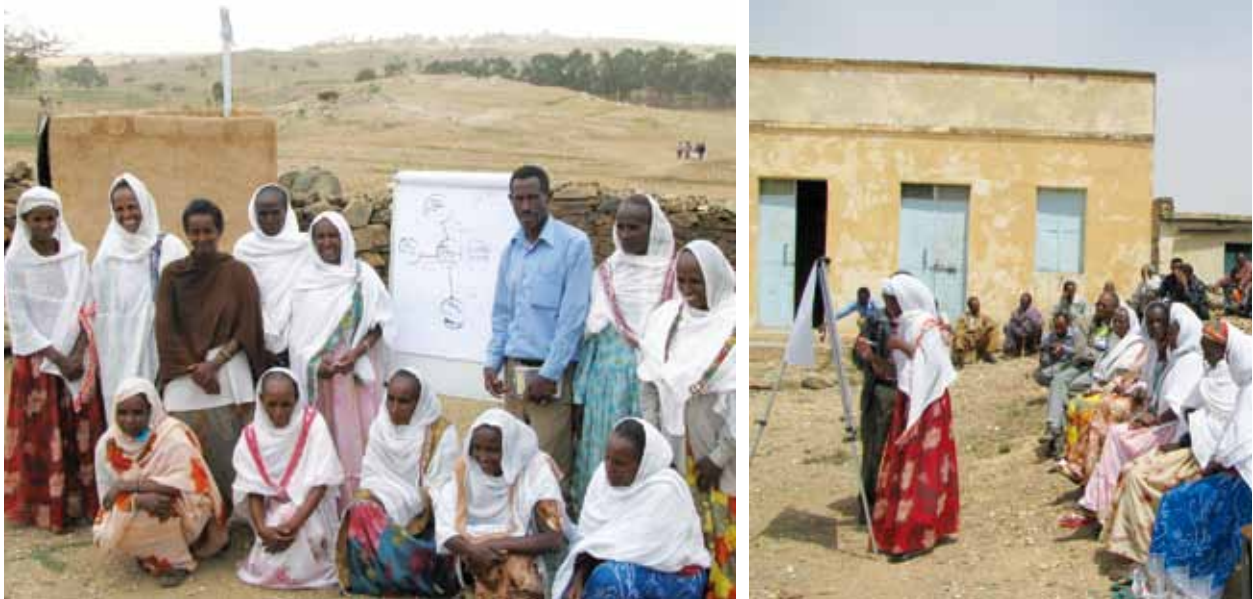
Right: The Natural Leaders standing with the village Chief and a map of the locations of the three villages. Left: Women Natural Leaders in Eritrea decided to clean up three neighbouring villages after declaring them ODF.

rationale, genesis, methodology and applicability of CLTS but also gain enough skills and experience of facilitation and real triggering with the communities. Therefore it is expected that the CLTS facilitators will know the Handbook on CLTS very well and be familiar with CLTS terminology before reading this Trainers' Guide.