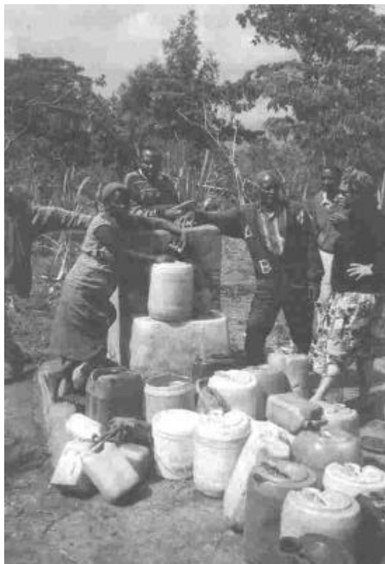
Figure 3. PAR team and community research team discussing water shortages at the public water standpost in Yanthooko, Kenya.