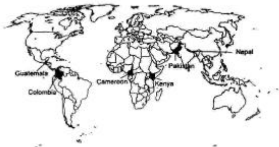
Figure 1. Countries of PAR research

This PLA Notes has a special focus on community water management. It has largely been drawn together by an international team from IRC, International Water and Sanitation Centre 1 , in collaboration with teams from six organisations world-wide 2 . It aims to share the lessons learned from a challenging participatory action research programme to improve rural communities' management of their water supply systems. This programme, known as the PAR-Manage project, has been running for the past five years in six countries from the South: Cameroon, Colombia, Guatemala, Kenya, Nepal and Pakistan (see Figure 1).