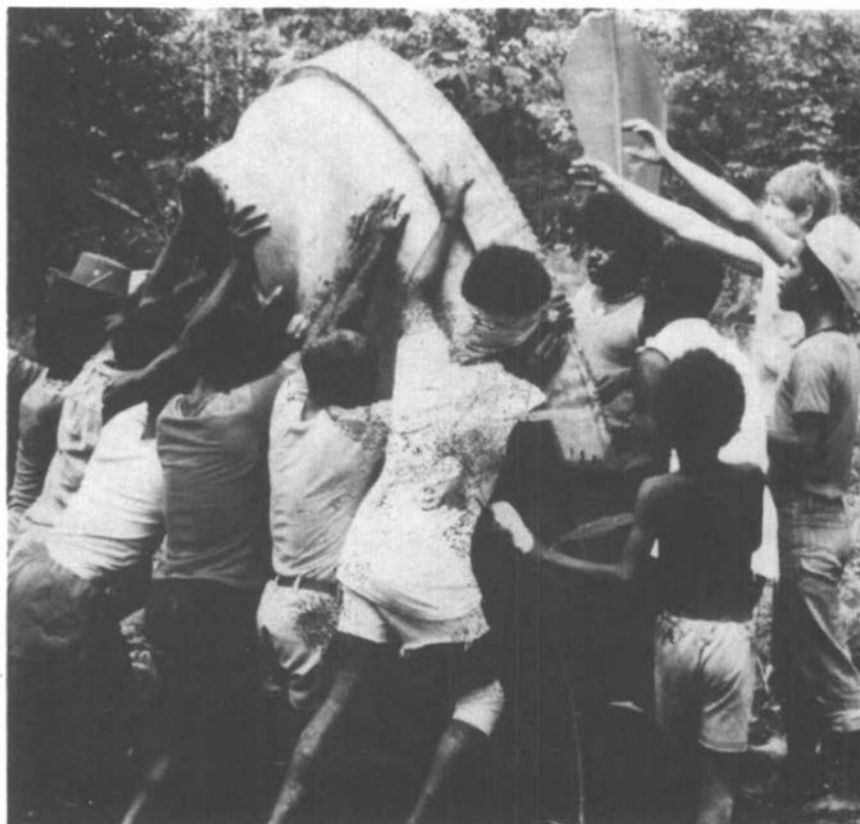
Turning over the completed top of the tank

the standard of their workmanship and the amounts of materials used.