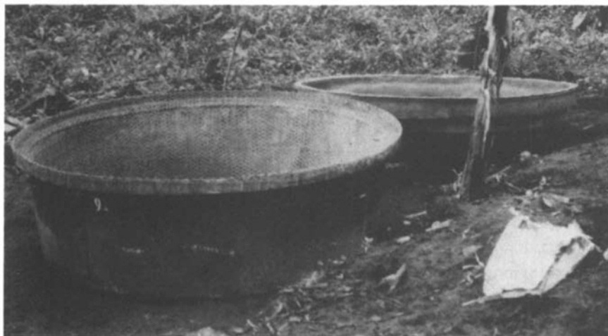
The sections of the bottom mould are joined, and the first layer of chicken wire fitted

*VIRTU, Box 14, Kieta, North Solomons Province, Papua New Guinea.