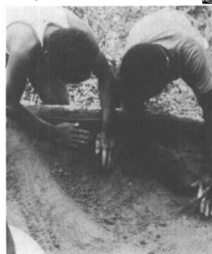
Forming the inside of the top half of the tank

This means that in the first year of production small-scale rural businesses in the province have gained approximately 6 per cent of the annual market for water tanks which represents a total gross income of K13,000 (US$ 14,794). It is estimated that with the present training programme this share of the market could increase to between 12 per cent and 14 per cent next year.