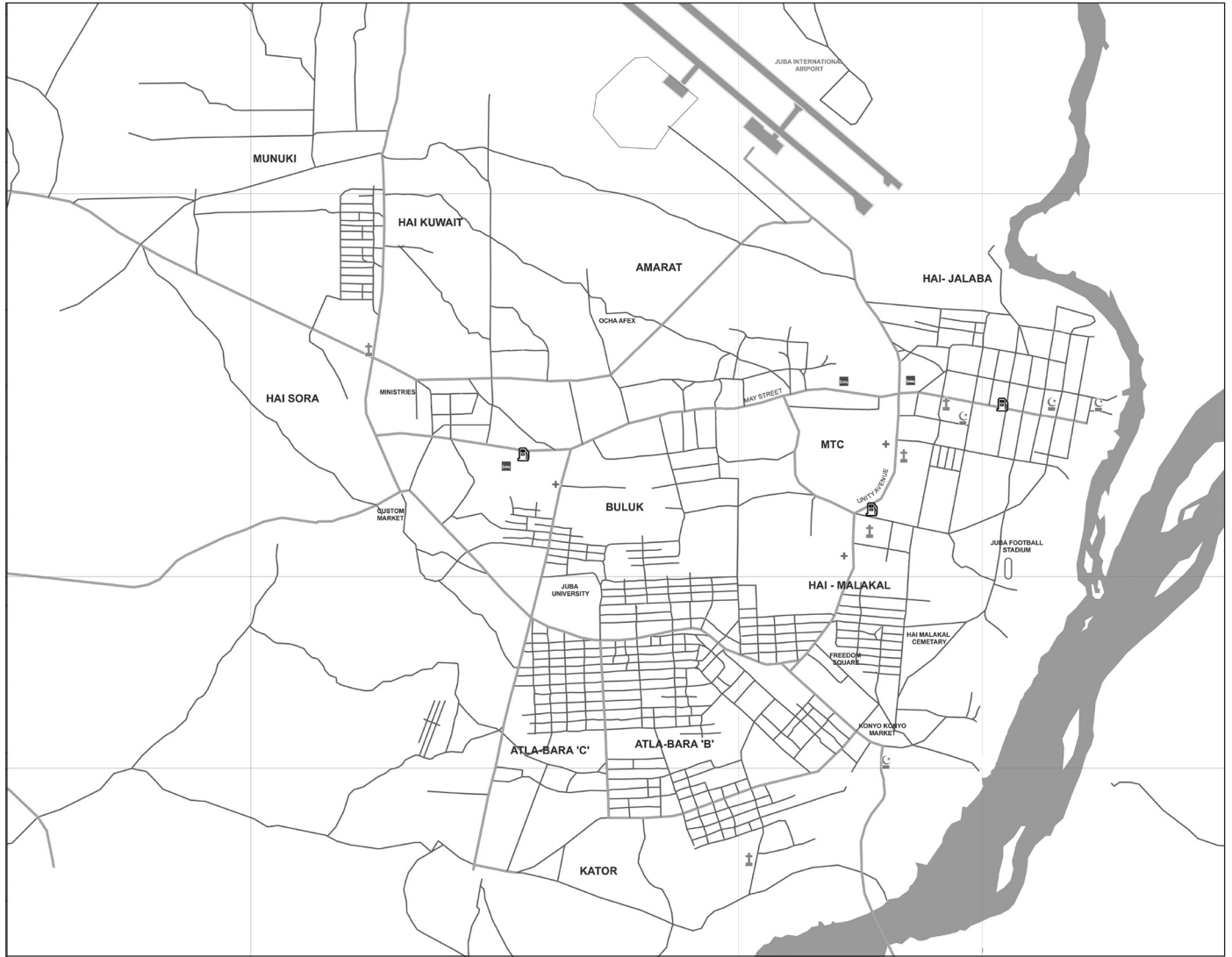
Figure 1: Map of Juba