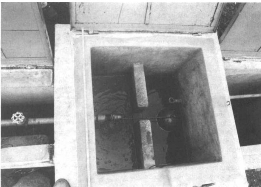
Figure 1. The classic BPT with unsubmerged inlet, costing about $US200.

Elimination of entrance and exit valve boxes The entrance valve is no longer placed outside the main BPT chamber, but inside, immediately before the float