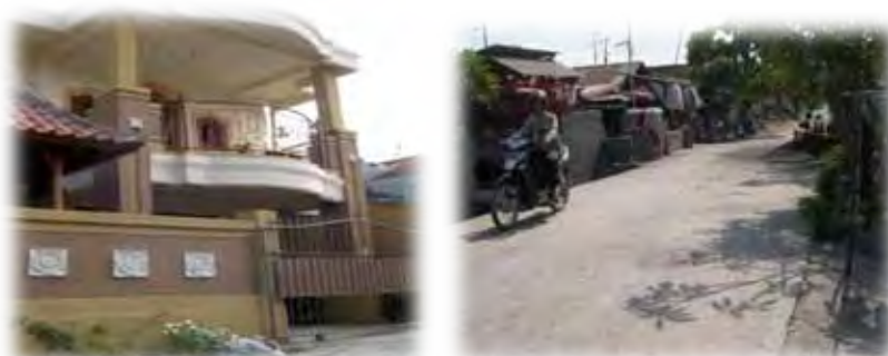
Flat connection fees and tariffs in a mixed neighbourhood in Denpasar, Indonesia, disproportionately benefit better-off households with high water discharge (Photo: Christine Sijbesma, IRC).

The tariffs for both centralised and decentralised sewerage services can be flat, weighted by payment capacity and benefits and/or exempt the most disadvantaged. However, flat fees can be notably inequitable, if neighbourhoods have a mixed population of rich and poor as in the two photos below which were taken in the same neighbourhood. Both types of households pay the same flat, low connection fee and monthly tariff.