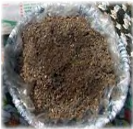
Compost from a dry toilet in peri-urban Kathmandu, Nepal

The significant advantage of composting toilets is the eradication of the necessity for removal and transport of raw sludge – an unpleasant and potentially harmful task until manual emptying can be replaced by very low cost mechanical devices which can manage the narrow paths and lanes in low-income urban settlements.