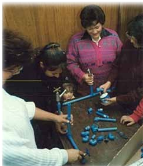
Women in an urban poor neighbourhood in Santiago de Chile are trained to become licensed plumbers for water supply and sanitation connections

Finally, EMOS sent mobile vans to the poor city sections on pre-determined days to make it easier to register for a connection, learn about the loan and connection services, and pay the monthly bills.