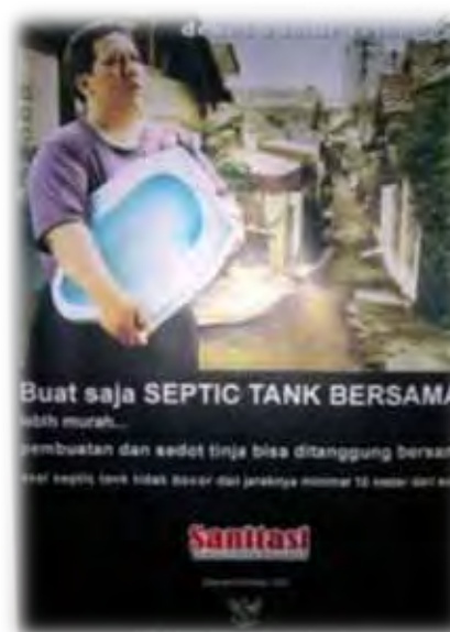
Campaign poster in Indonesia promoting male responsibility over buying a sanitary toilet for his family