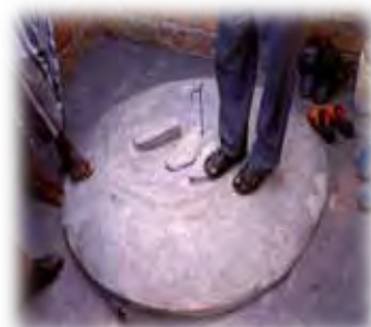
Two types of shiftable platforms; Low-cost full-cycle toilets (Photos by Jo Smet, IRC).

shallow pit (Box 16). Both options lend themselves therefore for self-financed construction or OBA in informal settlements and peri-urban areas with sufficient space for shiftable shallow pit latrines with reused concrete platforms.