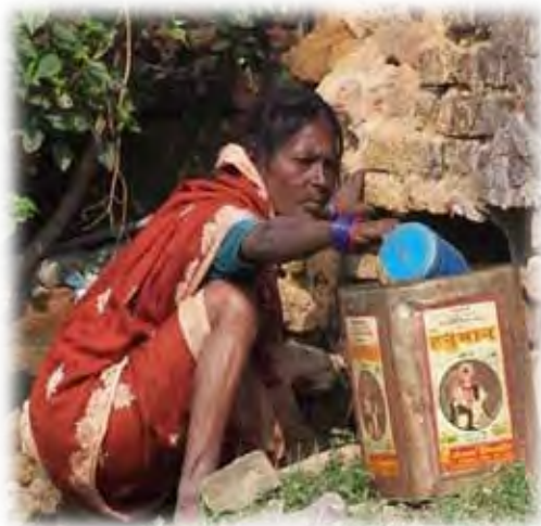
Woman scavenger emptying a toilet manually

The lowest level service for emptying pits and reservoirs is by hand, either by the households themselves or by a hired pit emptier from the informal private sector. Manual emptying, transport and dumping of human excreta and sludge are widespread. In India alone, an estimated 1.3 million poor women and men generate their income from manually emptying and carrying away toilet contents. This is also known as scavenging (Black and Fawcett, 2008), and is also common in cities across Africa (Collignon and Vezina, 2000; Eales, 2005; Mikhael and Scott, 2011).