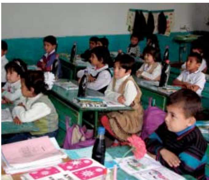
Fig. 2: Schools required their kids to bring their own SODIS bottle

JDA trained its local SODIS staff, consisting of one coordinator, two trainers and four promoters on the technical aspects of SODIS, as well as community development practices, facilitation, PRA methods and Adult Teaching techniques. The promoters went out to the villages regularly for the introduction of SODIS to many segments of the society and to carry out regular supervision.