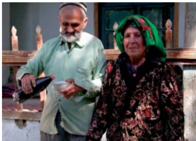
Fig. 7: An elderly Uzbek couple drinking SODIS water

SODIS has the potential to improve the health of many people in Central Asia. It is a simple, cost-effective method that saves natural resources and could easily be applied in every household. It puts the responsibility for the people's health back into their own hands.