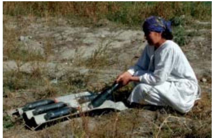
Fig. 3: Village Health Posts get now clean drinking water by using SODIS

It proved to be an effective way to introduce new ideas to the rural communities by first addressing schools. Children were open to try the new method. Some schools made it even mandatory for their pupils to bring bottles to the school and have them used for SODIS. Each child had its own bottle with clean drinking water!