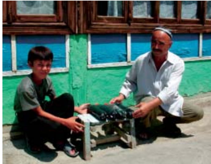
Fig. 4: SODIS appears to be an ideal method for the rural population in Uzbekistan