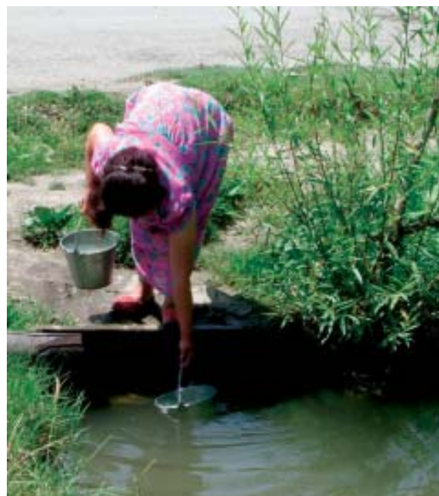
Fig. 1: In many places, people get their drinking water from unprotected, open ponds

To bring about real health improvements, the introduction of new treatment methods has to go hand in hand with hygiene promotion.