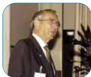
IRC Chairman Joop Hoekman

During 2004 we passed the halfway point in the current IRC Business Plan (2002-2006). I am pleased to report that we are well on track to achieving our main objectives. Increasingly IRC has visible outputs to show for the work that we do.