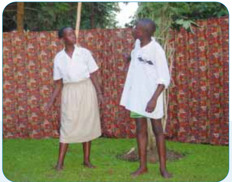
Uganda: drama about sanitation

The new electronic Interwater Thesaurus will be published in English in 2005, followed quickly by translations in French and Spanish.