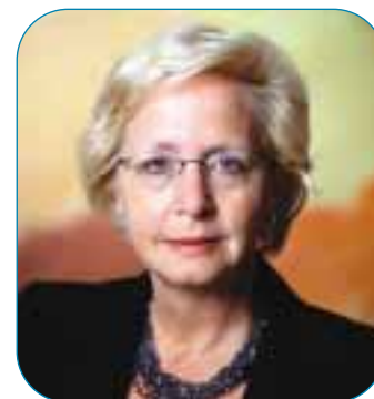
Mrs. Agnes van Ardenne

Mrs. Agnes van Ardenne, Minister for Development Co-operation of the Netherlands, pledged to double Dutch support for the UNICEF/IRC school sanitation and hygiene education programme to two million US dollars over three years.