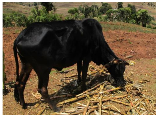
Figure 2. Tethered oxen at Ganda Galan, fed with maize stalks near the homestead.

Traditionally farmers in the area did tether oxen for fattening at the homestead while other animals were herded. Male household heads normally decided which animals would be fattened and on which feed, making sure that they got fat for sale within a short period of time. However, the actual supplementary feeding and watering at home was done by women. This practice has prepared men and women to some extent for the current new trend to tether all livestock, including small ruminants, at the household and feed them there under the cut-and-carry system.