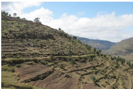
Figure 7. Terracing at Ganda-Galan watershed.

Between 1995 and 2005, the degraded upper catchment of the spring, 220 hectares of former communal grazing and farming land, was rehabilitated as part of DAP1 and later the Productive Safety Net Program. Farmers who were identified as food insecure participated in the watershed management activities through cash or food for work. Various soil and water conservation structures were developed in the large area upstream of the spring, such as terraces, half-moon ponds and other water harvesting and soil retention structures. These bio-physical measures were started, maintained and extended over the years under the different programs to rehabilitate the degraded land and improve the discharge of the spring. In addition, different multi-purpose trees were planted and exclosures established.