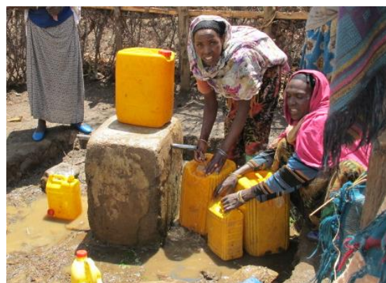
Figure 4. Gende-Abdule domestic water point.

Because of the limited budget the water system was developed with a single water point connected to the spring box and no reservoir (the spring flow continuously with an average discharge of 0.011 l/s). Below the domestic water point, the overflow continued to feed the traditional pond used for livestock watering and as night storage for small scale irrigation.