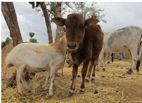
Figure 3. Tethered calf and sheep Gende-Abdule, fed with teff straw near the homestead.

Revenues from fattened oxen and cows are usually controlled by men, while women derive income from dairy cows, and small ruminants and chicken.