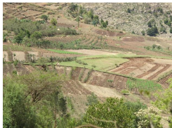
Figure 10. Irrigated fields at Ganda-Galan.

to irrigate more than seven hectares of land. The irrigation water users association manages the irrigation facilities, allocates water and collects the user fees for operation and maintenance. At the establishment of the water users association the 62 farmers contributed around € 2 with an intention of using this fund for building a potato storage warehouse. It was also planned to act as a cooperative for buying inputs at low cost and selling products at the best market price. This failed because the contractor did not deliver the warehouse as planned. Subsequently, the users stopped contributing the irrigation fees.