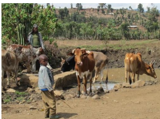
Figure 5. Gende-Abdule cattle trough.

The water supply system is in service during specified hours in the morning and evening and then closed to fill the irrigation reservoir. Currently, 92 households benefit from the domestic water supply, while 47 households use the irrigation facilities.