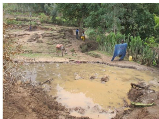
Figure 8. Pond for livestock watering at Ganda-Galan.

The area is closed for free grazing and agriculture, which is institutionalized in communal by-laws to protect the area from human and animal interference. Livestock are kept tethered at the homestead and fed through the cut-and-carry system. For small animals, water is brought to the homestead from the domestic water point, which is of good quality. For larger animals this is inconvenient, so they are brought to the traditional pond for drinking, even though the water quality is perceived as poor.