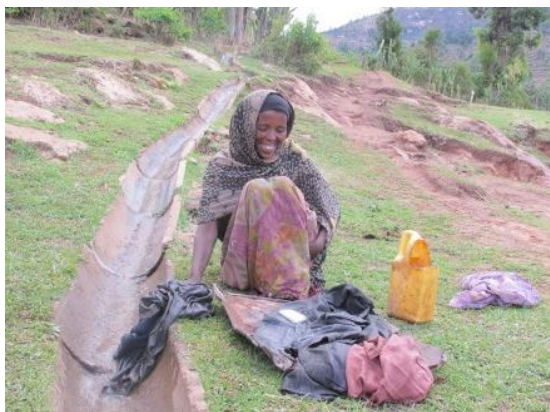
Figure 9. Irrigation canal used for laundry in Ganda-Galan.

resource management policy of the country. HCS together with the district water office provided training for two committees, established for separately managing irrigation and domestic uses. Both committees have developed by-laws with the users to prevent and mediate the conflict of uses.