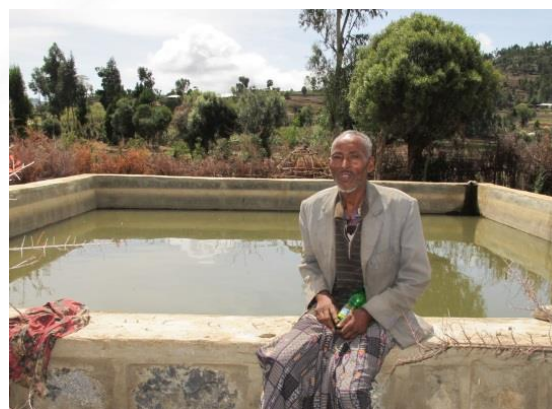
Figure 6. The irrigation reservoir at Gende-Abdule with the owner of the land.

private farm land that was given for free, though the farmer was given priority rights by the community to use the irrigation water for his qat and cash crop production.